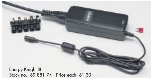
Energy Knight III Stock no.: 69-881-74 Price each: 61.30

Easily adapted to a number of different computers thanks to a unique jumper system and replaceable secondary connectors. For a complete list of all computer models see www.elfa.se .