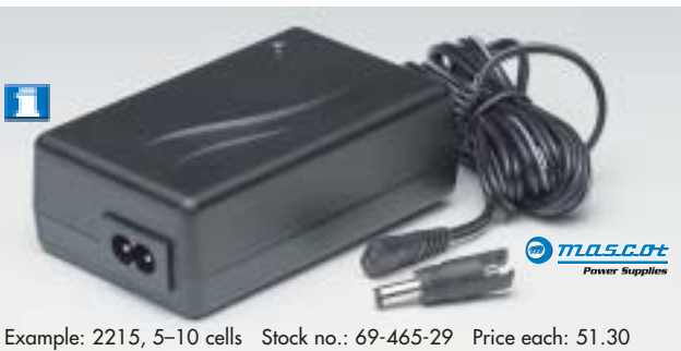
Example: 2215, 5-10 cells Stock no.: 69-465-29 Price each: 51.30

NiMH charger for 3 to 20 cells in 5 different models. Meets the EN60601 norm for medical equipment. For information on all models, technical data and prices see www.elfa.se .